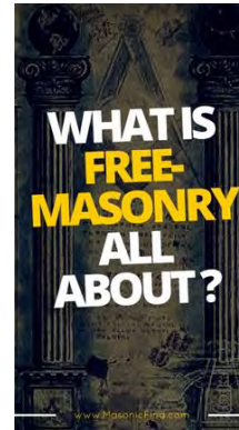
What is a "lodge"

The word "lodge" means both a group of Masons meeting in some place and the room or building in which they meet. Masonic buildings are also sometimes called "temples" because much of the symbolism Masonry uses to teach its lessons comes from the building of King Solomon's Temple in the Holy Land. The term "lodge" itself comes from the structures which the stonemasons built against the sides of the cathedrals during construction. In winter, when building had to stop, they lived in these lodges and worked at carving stone.